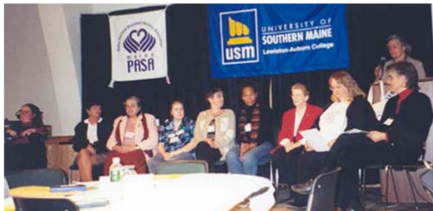
Maine PASA members and presenters discuss the value of associations