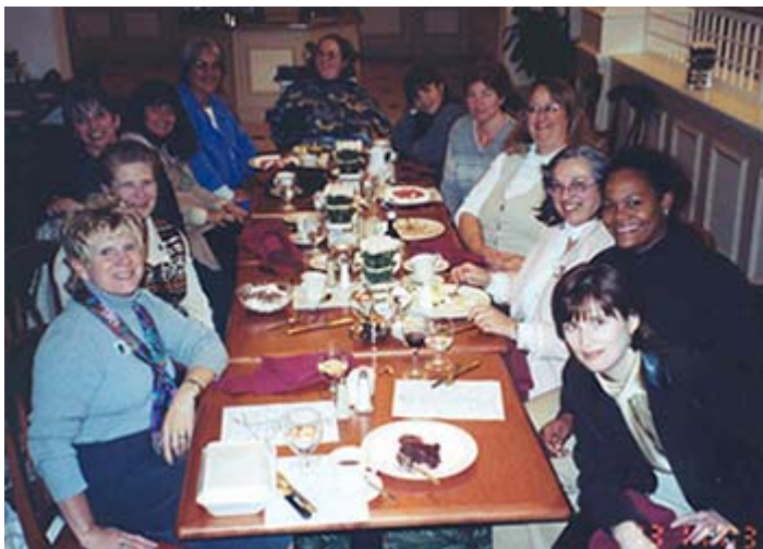
Maine PASA members met with guests from Florida, Connecticut, Vermont and Washington, DC associations at the Maine PASA Pre-Event Dinner