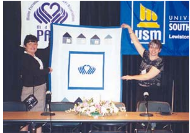
Our Door Prize was made by one of our own Maine PASA supporters!